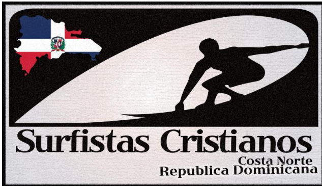
The new logo for the group at Encuentro